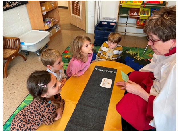
Some of our Church school children in class.