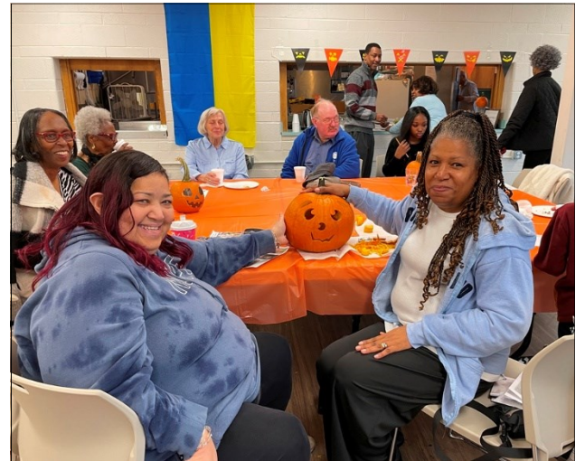
Decorating Pumpkins was enjoyed by young and old alike.