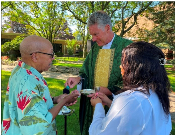
Receiving communion at our outdoor service.