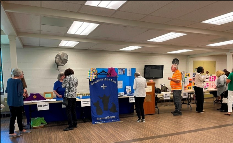
The Ministry Fair highlights the many programs that are available at St. David's.