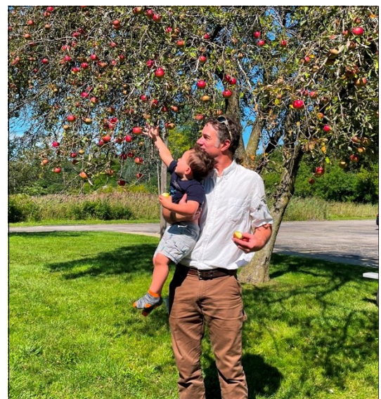
Our apple tree had plenty of apples this year.