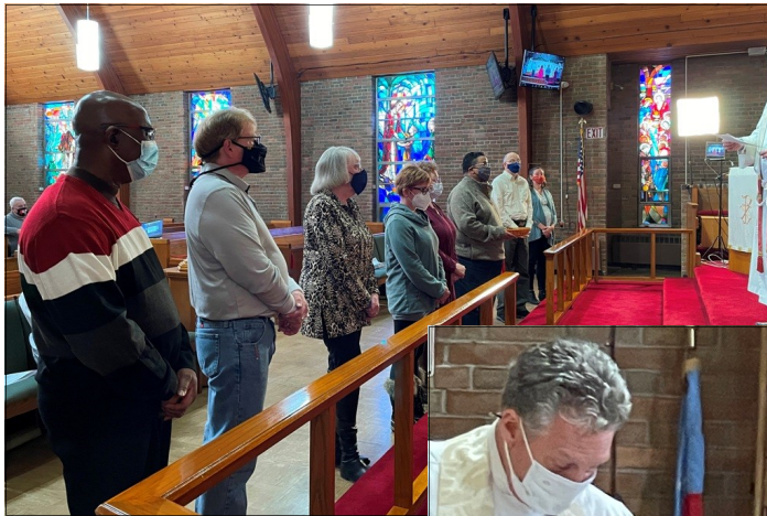
Prayers and . . .