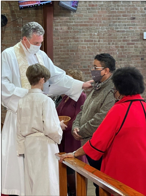
Commissioning Senior and Junior Wardens

Celebrating St. David's 70th Anniversary