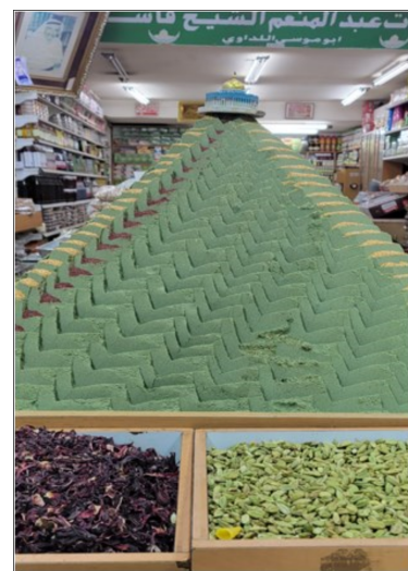
Buying spices in the Old City Market ~Audrey