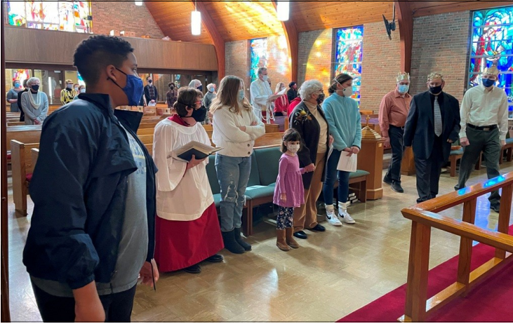
Ready for Church School