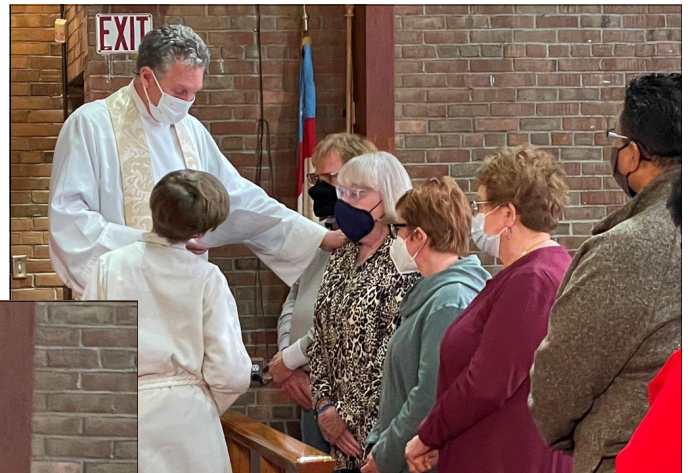
the commissioning of our new vestry members