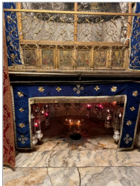
Bethlehem: marking where Jesus was born.